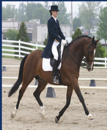
Ventura, started in 2002 by La Riata Ranch Champion FEI 5-year-old 2004 WBFSH Selection Trials, Competed YH Championships 2004