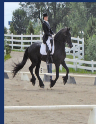
Maraus, 5-year-old Friesian stallion. Trained by La Riata Ranch. Training level champion at his first show out.

Call us at 712-778-5295 (Barn) or 402-598-7475 (Cell) or Visit us at www.lariataranch.com